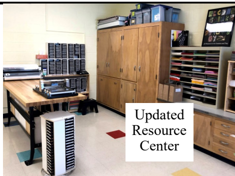
Updated Resource Center

Thank you to High Vibe Fitness staff and members for their generous donation of over 13,000 diapers for our community closet! We appreciate you.